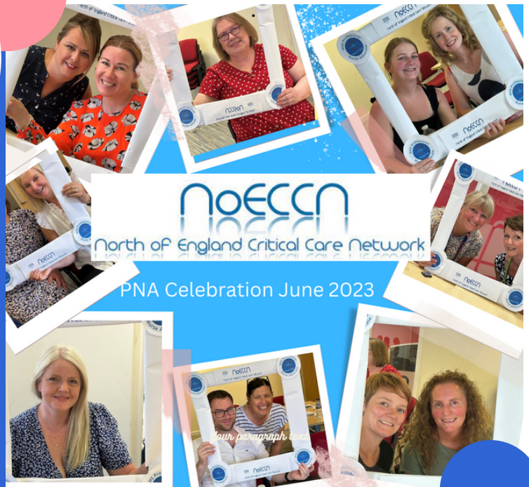
PNA Celebration June 2023