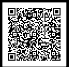
NoECCN Transfer Guidelines

Acute, traumatic, time-critical lesion? OR Meets other criteria for urgent transfer to Major Trauma Centre? - Explanatory notes 4.4 & 4.5